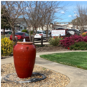
Flowers were blooming and the grounds were made ready