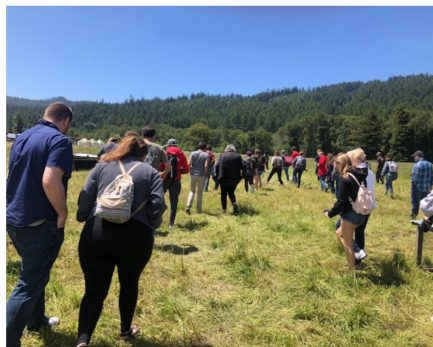
PATHWAYS 2020 IN BUTTE COUNTY Helping those affected by the Camp Fire in Butte County #PARADISESTRONG

Camperships are available. Click here to apply: bit.ly/NorCalSummerCampership2020