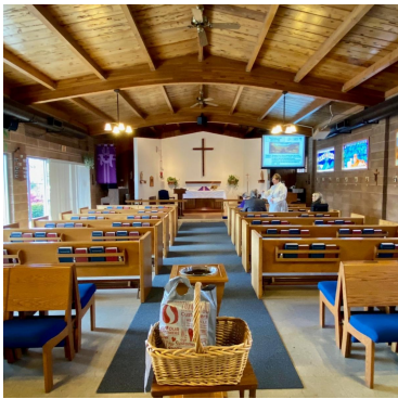
The recently remodeled sanctuary waits expectantly for worship