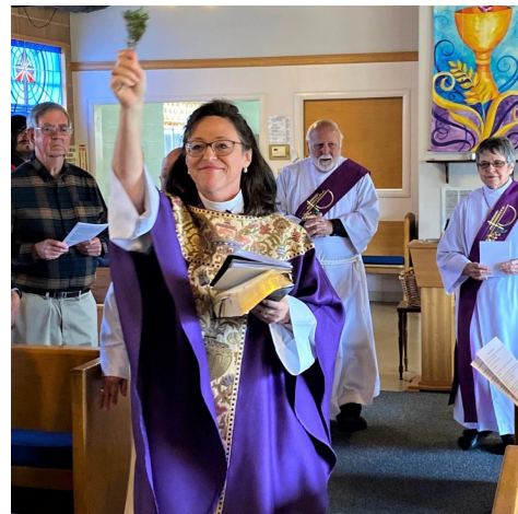
Lord God...Sanctify this sanctuary, dedicated to you. Let it be to us a sign of the heavenly sanctuary where your saints and angels praise you forever...