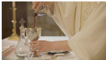
"When we remember who we are and who God is; when we give thanks for that, we are making Eucharist in a very real way"