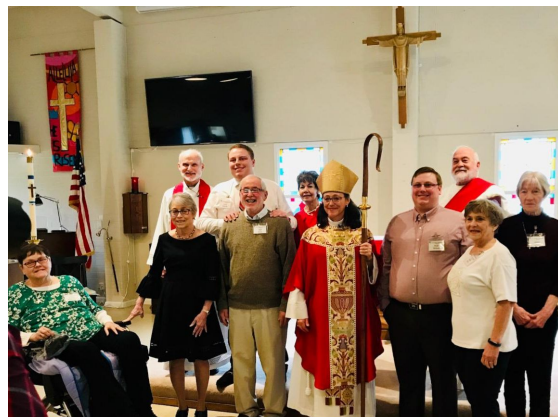
"Almighty and everliving God, let your fatherly hand ever be over these your servants..." BCP 419