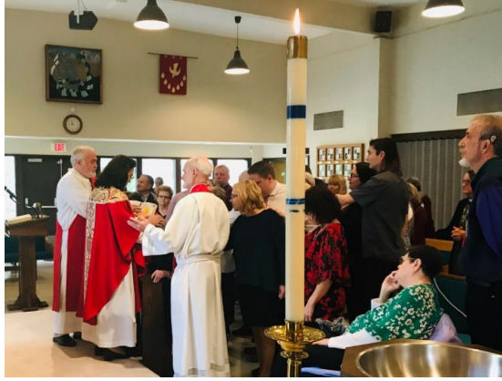
The people of St. George gather around the confirmands and those reaffirming their faith in one parish-wide service.