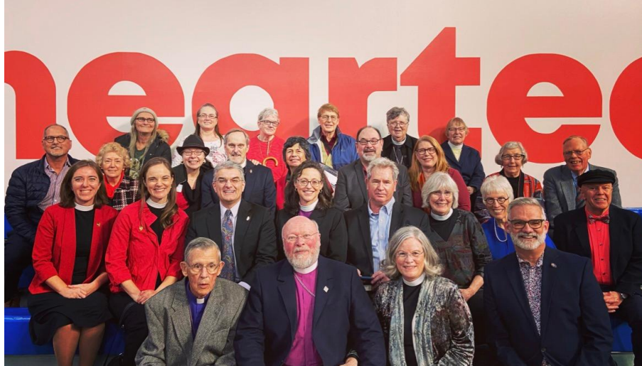
A portion of the good people from EDNC who attended the consecration