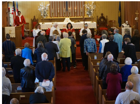
"Will you who witness these vows do all in your power to support these persons in their life in Christ?" BCP 416