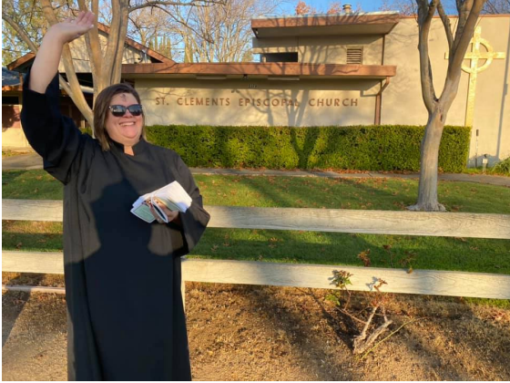
Ashes to Go offered curbside at St. Clement's, Rancho Cordova