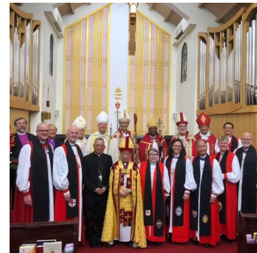
Bishops from around the world participated in the consecration along side Bishop Megan and others from The Episcopal Church