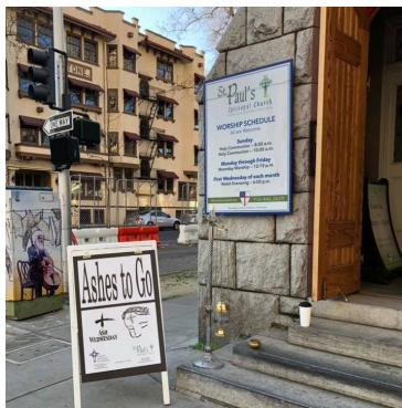
The doors are open for