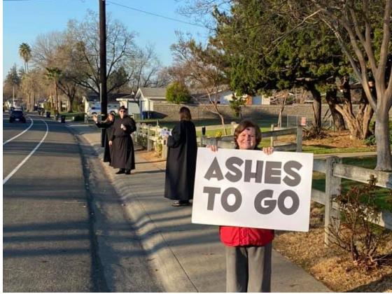
A team of ten evangelists were present on the sidewalk to greet commuters, impose ashes and pray

It was Feb 26 th and it felt like spring on this winters morning in Rancho Cordova, California. The sun was shining and the trees were in full bloom. Zinfandel Drive was nearly bumper to bumper with cars rushing to work or school.