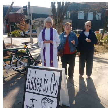
A team of evangelists, led by