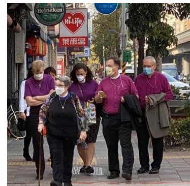
Province VIII bishops walking to St John's Cathedral for