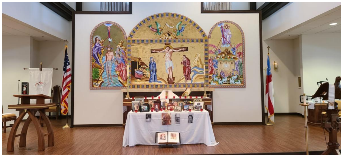
St. John's, Roseville