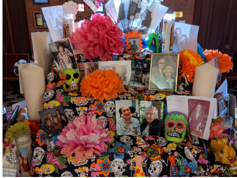
Trinity Cathedral, Sacramento