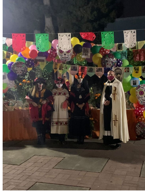
Incarnation, Santa Rosa