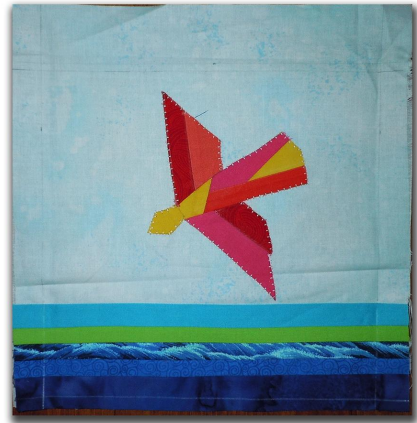
Quilt block from St. Michaels' Carmichael