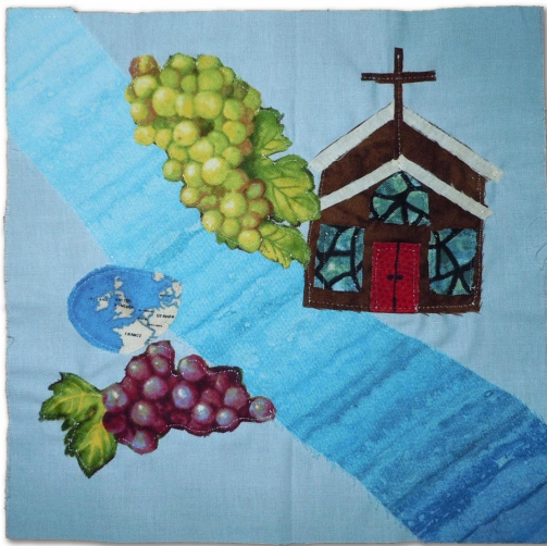
The beautiful Quilt Block from Holy Trinity, Ukiah