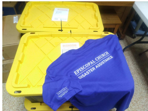
Project (Re)Start bins and t-shirts are ready for the next disaster

EPISCOPAL DIOCESE OF NORTHERN CALIFORNIA