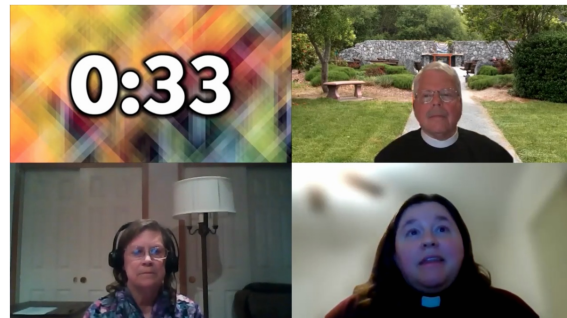
Town Hall 1 101321