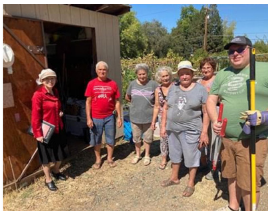
St. George's, Carmichael