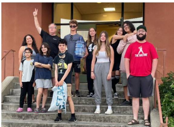
Faith, Cameron Park

Trinity, Sutter Creek www.trinitysuttercreek.org