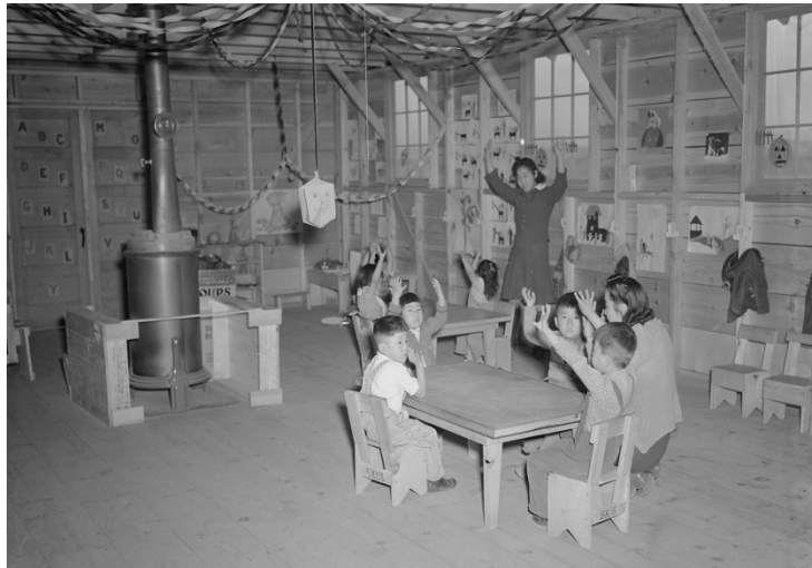
Original caption: Tule Lake Relocation Center, Newell, California. Nursery school children singing "Twinkle, Twinkle, Little Star." Photo: Francis Leroy Stewart, 2 November 1942. Central Photographic File of the War Relocation Authority.

Official photos of “evacuees” in camp showed happy children in school and at play, smiling young women, residents diligently at work or enjoying a parade and harvest festival, and so on. These images were in keeping with the euphemistic rhetoric that the federal government used to describe the forced removal and detention of Japanese Americans. Non-citizens and citizens alike were “evacuated” to “assembly centers” and subsequently moved to “relocation centers,” such as Tule Lake.