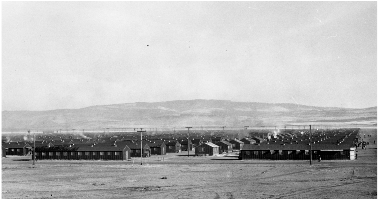
Two rows of barracks at Tule Lake. The smaller buildings between the rows are latrines, laundries, and mess halls.

The camp at Tule Lake – hot in the summer, cold in the winter, windy, dry, flat, largely treeless, and desolate – lies in the northeast corner of the Episcopal Diocese of Northern California. Like the other War Relocation Authority (WRA) concentration camps that imprisoned Japanese Americans, a high barbed wire fence surrounded the compound, with strategically placed guard towers staffed by armed sentries. Barracks, mess halls, latrines, washrooms, and other community buildings lay within the fence.