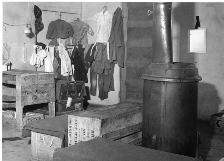
Interior of an apartment within the barracks. The residents repurposed packing crates for a table and seating.

However, the reality was much grimmer and harsher. Barracks, 20 feet by 100 feet, typically were subdivided into four one-room apartments where families were often over-crowded into one or if necessary, two apartments. Wind whistled through cracks in the walls of uninsulated buildings hastily constructed from green wood and tar paper. Coal burning stoves supplied heat. Light in each room came from small windows and a single bare light bulb. The only furniture provided was a metal