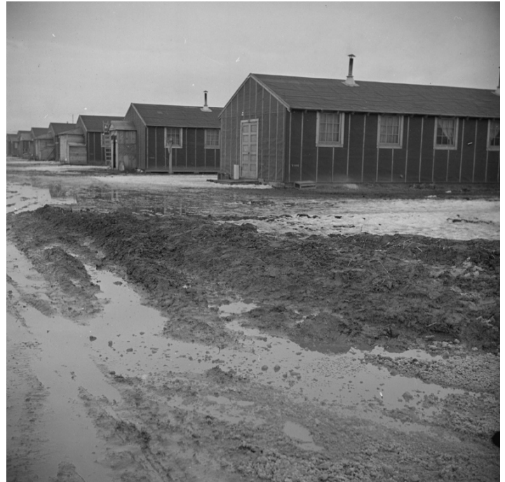
Barracks and winter snowmelt, 2 February 1943.

Look for next month’s article about the deeply flawed loyalty questionnaire and its consequences for Tule Lake. For a brief introduction to the incarceration of Japanese Americans, please see the first two articles in this series.