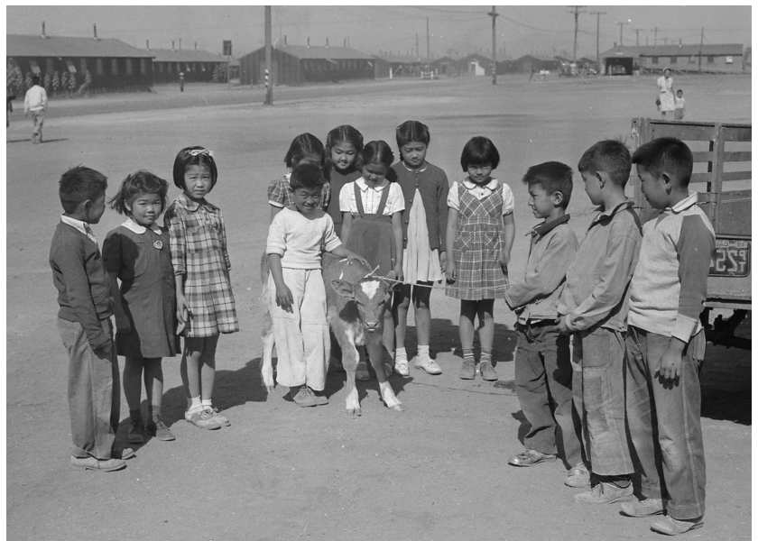
Original caption: Tule Lake Segregation Center, Newell, California. These elementary school children at the Tule Lake Center are thrilled at the sight of their first calf.