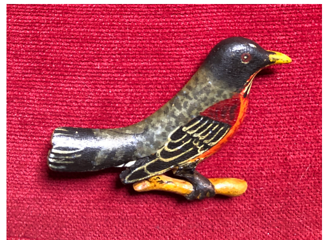
Gift of the Hoshiko family to the Lewis family.