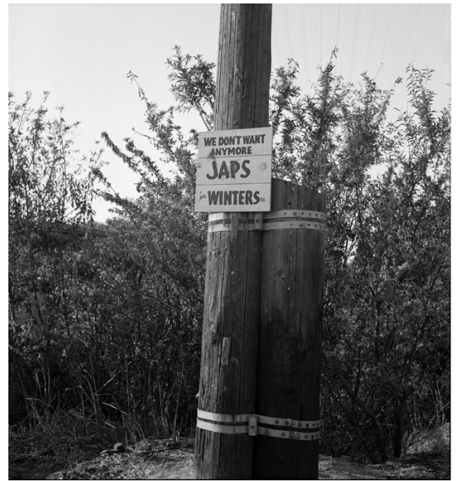
August 1943: A new sign on the outskirts of Winters, CA. A fire of unknown origin destroyed Winters' Japantown in 1943. Only 15% of the pre-war Japanese community eventually returned to Winters.