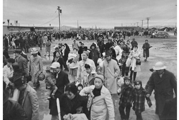
Renunciants leaving Tule Lake for Japan. Photo: Jack Iwata, 1945. Japanese American National Museum.

Tule Lake remained open through March 20, 1946, to imprison inmates considered “disloyal” based on “no-no” answers to two questions on a poorly worded loyalty questionnaire. The continued pressures of incarceration, including the imposition of martial law at Tule Lake in late 1943, disinformation, bitterness, and anger about their unjust treatment caused 5,461 prisoners at Tule Lake and 128 from other camps to renounce their US citizenship and request repatriation to Japan. Of those at Tule Lake, 1,327 were expatriated. Most renunciants who remained in the U.S. were stripped of birthright citizenship, rendering them stateless.